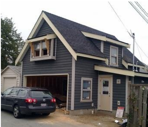
Figure 2 Coach house atop garage

A coach house suite is currently not permitted in any zone district. The rationale previously considered is that of potential intrusion on the privacy of neighbouring properties. The counter argument is that under current zoning setback rules, a principal dwelling could occupy the same space without any consideration for privacy of adjacent property. The Town has no