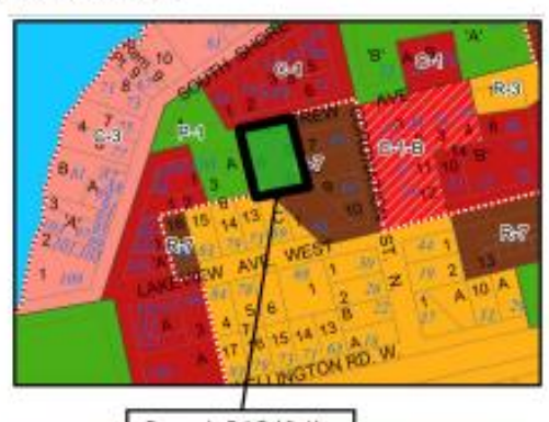
Rezone to P-1 Public Use