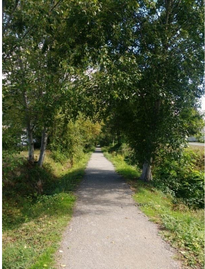
Figure 2 Trans Canada Trail

linking open spaces, parks, and activity centres that form a greenways network.