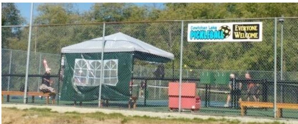
Figure 1 New Pickle ball facilities at Cowichan Park / Moneys Creek built with private donations

The following Recreation, Parks and Institutions goals, objectives, and policies advance the healthy community factors of physical environments, education, health services, and social support,